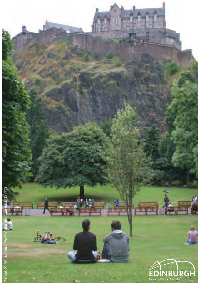
Princes Street Gardens: www.edinburgh-inspiringcapital.com

Please contact the International Office for further information ( international@napier.ac.uk )